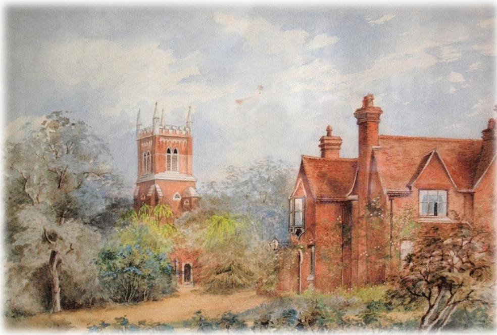
(CHRIST CHURCH WARLEY – APPROX. 1890'S)